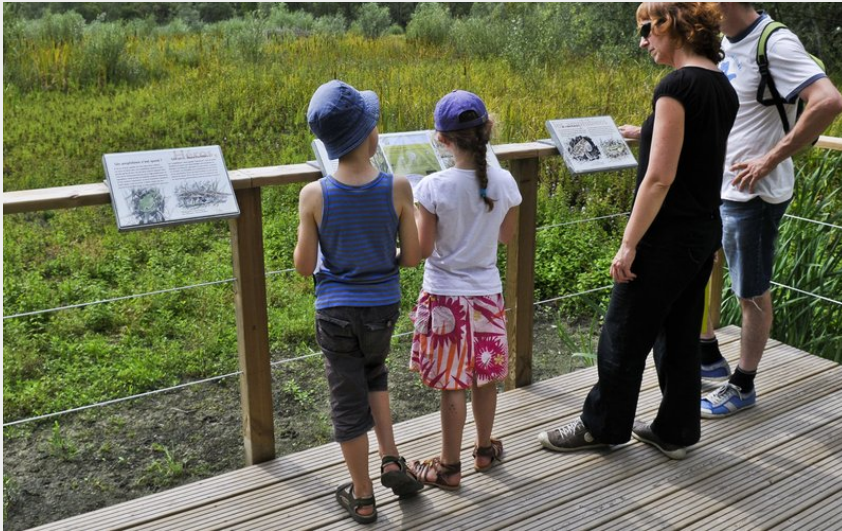
Panneaux d'interprétations (Commune Loire - Authion)

Balades et randos région de Loire-Authion - Loire-Authion