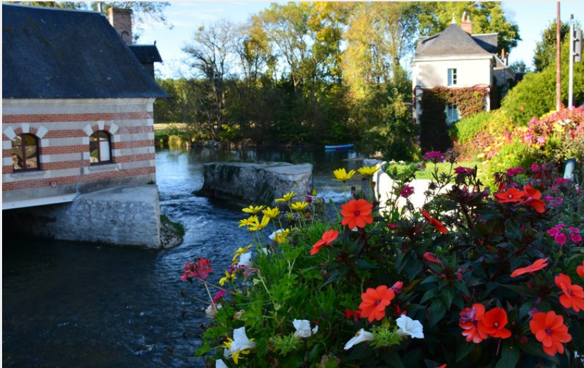
Artannes-sur-Indre (Aurore Poveda)