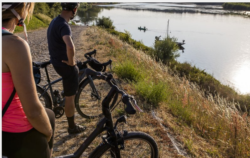
Couché de soleil sur le port de Bréhémont (David Darrault)