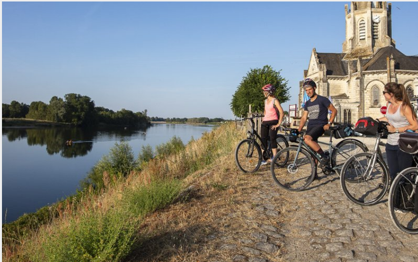
Cyclistes sur le port de Bréhémont (David Darrault)