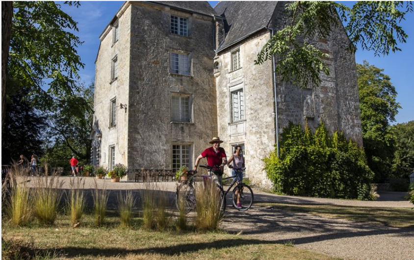
Château de Saché - Musée Balzac (David Darrault)

Balades et randos région d'Azay-le-Rideau - Saché