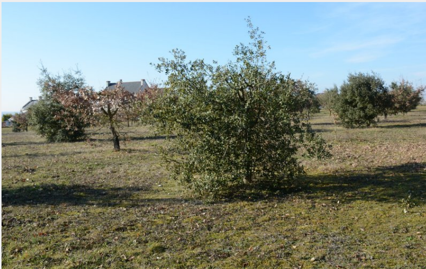
Photographie d'une truffière au moment de la récolte

Balades et randos région de Richelieu/Ile-Bouchard/Sainte Maure - Marigny-Marmande