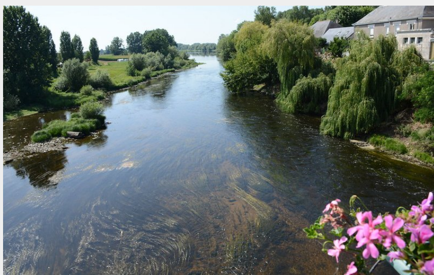
Photographie de la Vienne (Aurore Poveda)