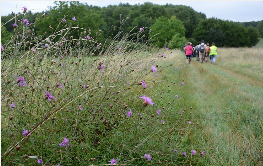
Randonneurs dans la forêt (Aurore Poveda)