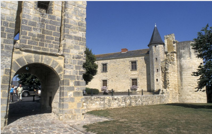
Photographie des ruines du château de Sainte-Maure-de-Touraine

Balades et randos région de Richelieu/Ile-Bouchard/Sainte Maure - Sainte-Maure-de-Touraine