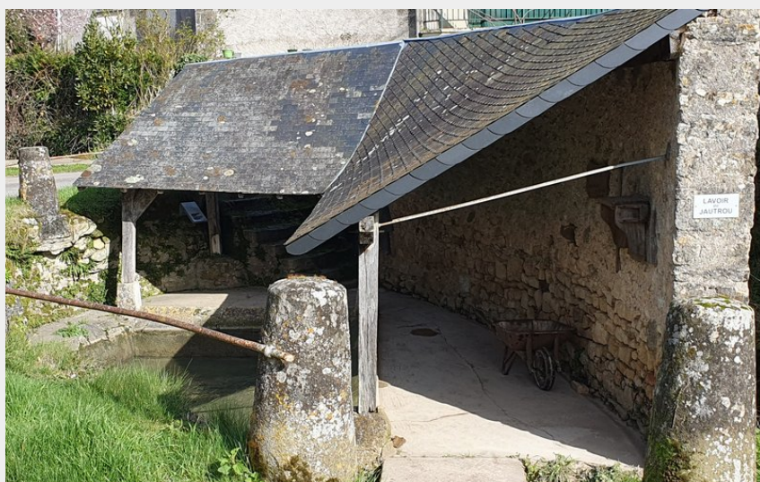
Photographie du lavoir du Jautrou, l'un des nombreux lavoirs sur cette randonnée.