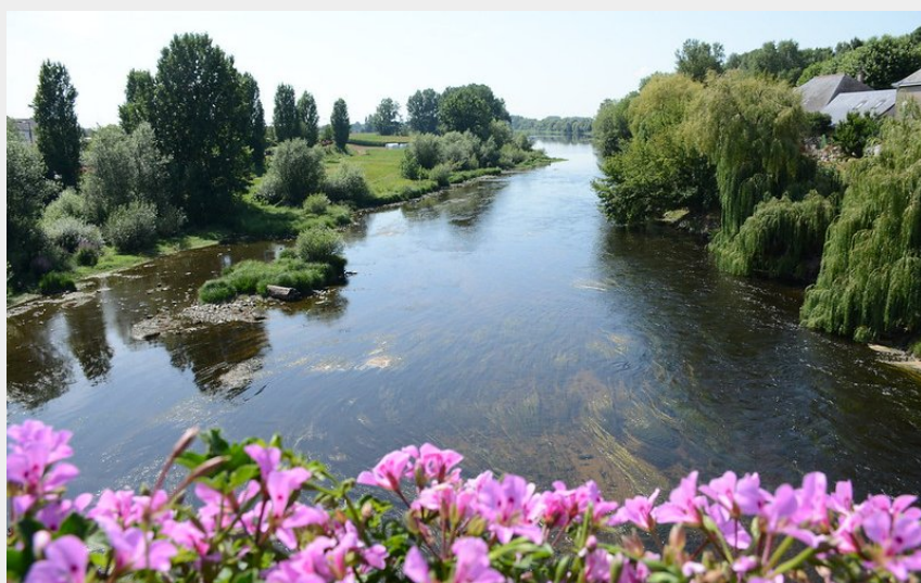
Photographie de la Vienne

Balades et randos région de Richelieu/Ile-Bouchard/Sainte Maure - Nouâtre