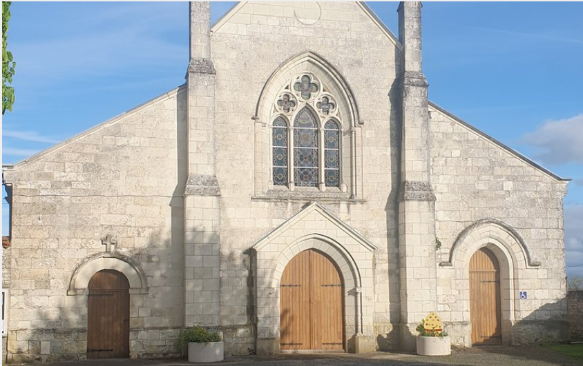
Photo de l'église de La Tour-Saint-Gelin