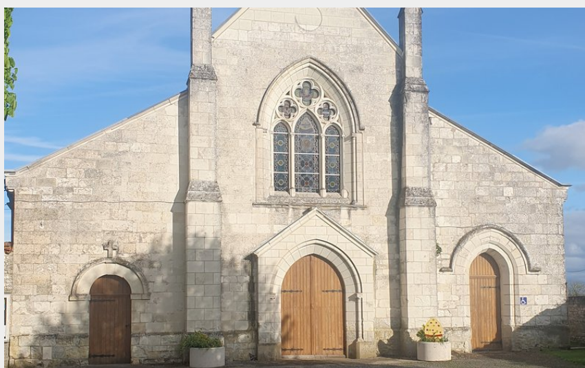
Photo de l'église La-Tour-Saint-Gelin