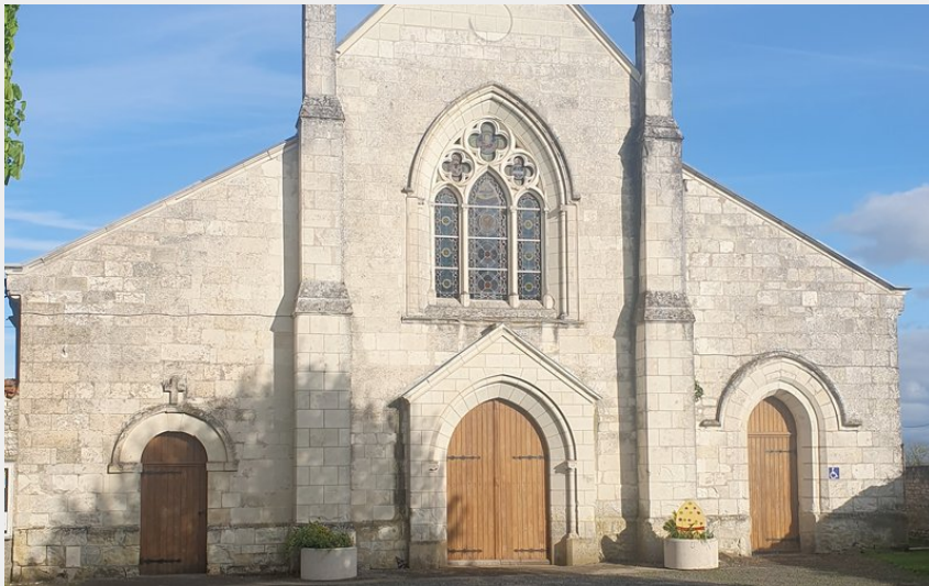
Photo de l'église La-Tour-Saint-Gelin