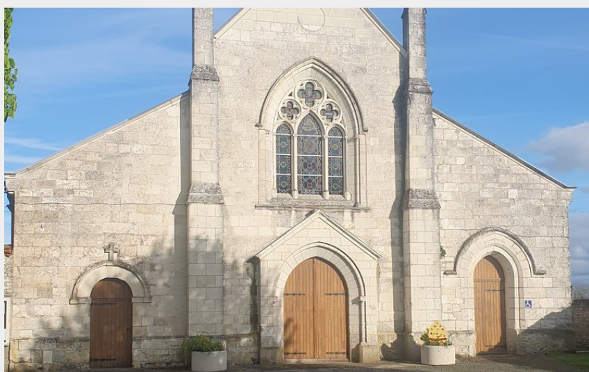
Photo de l'église La-Tour-Saint-Gelin