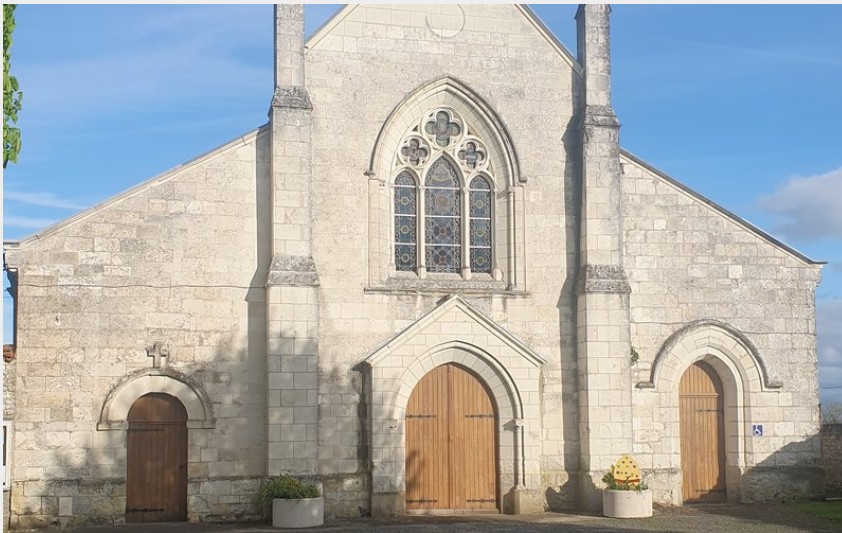
Photo de l'église La-Tour-Saint-Gelin