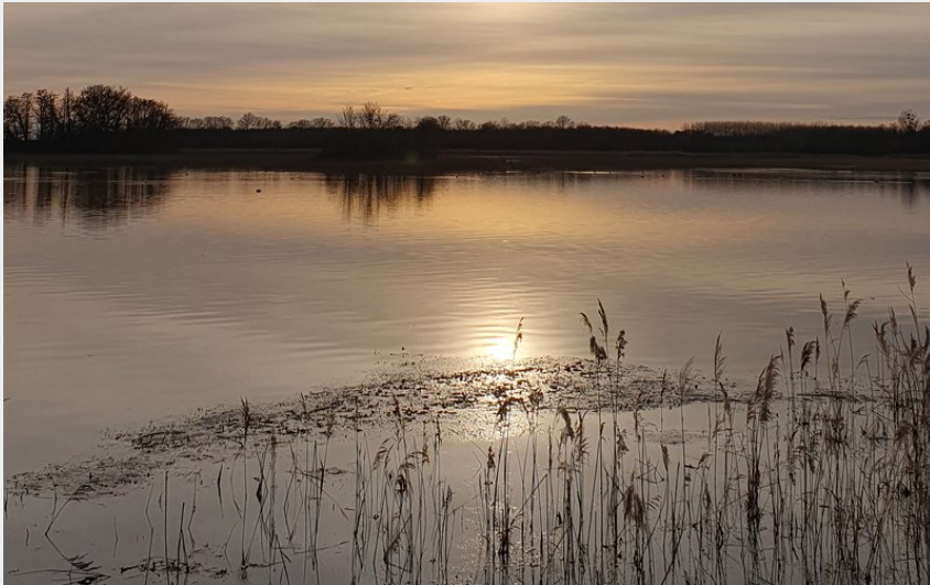
Coucher de soleil sur l'étang d'Assay.