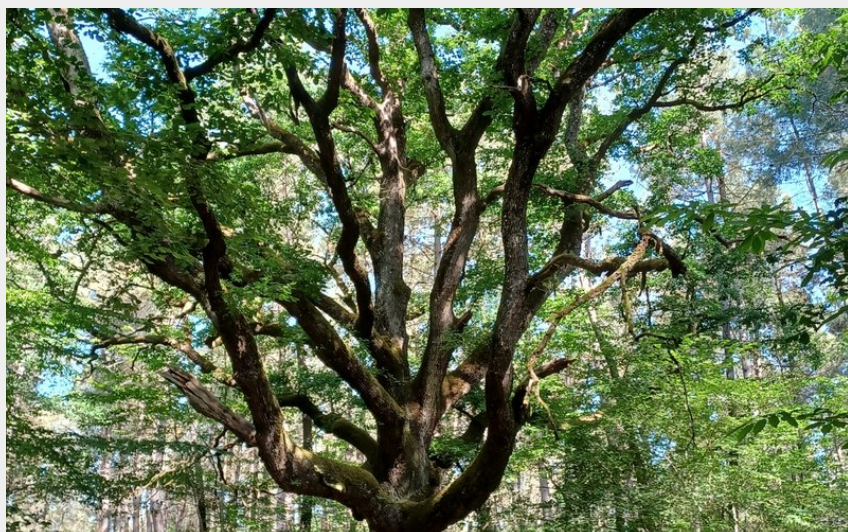
L'arbre remarquable lors de ses beaux jours (actuellement tombé)