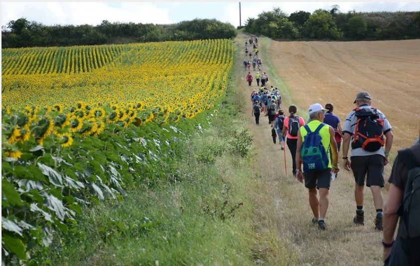
Randonneurs et champ de tournesols (Aurore Poveda)