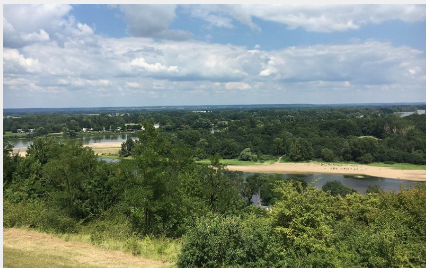
Vue sur la confluence de la Vienne et de la Loire (Aurore Poveda)