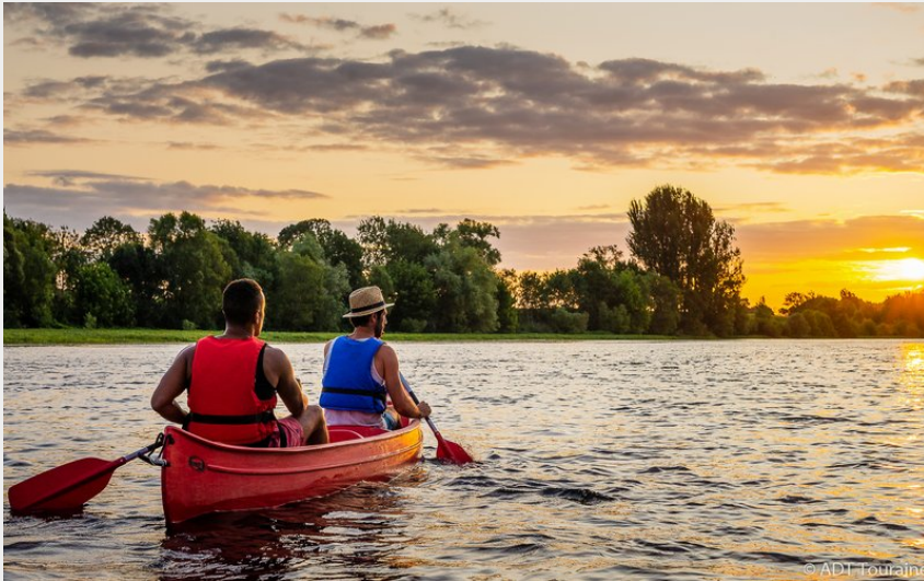
La Vienne, un cours d'eau surprenant