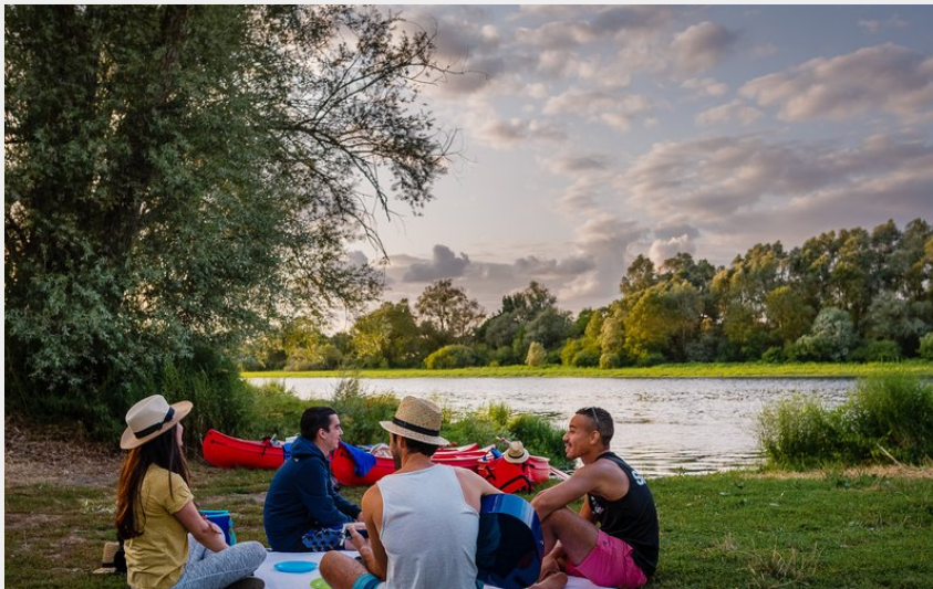
Pause au bord de la Vienne

Balades et randos région de Richelieu/Ile-Bouchard/Sainte Maure - Parçay-sur-Vienne