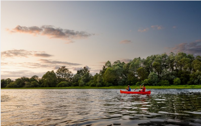
Coucher de soleil sur la Vienne