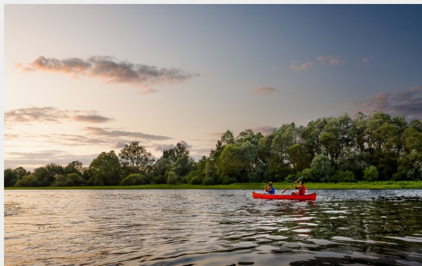
Coucher de soleil sur la Vienne