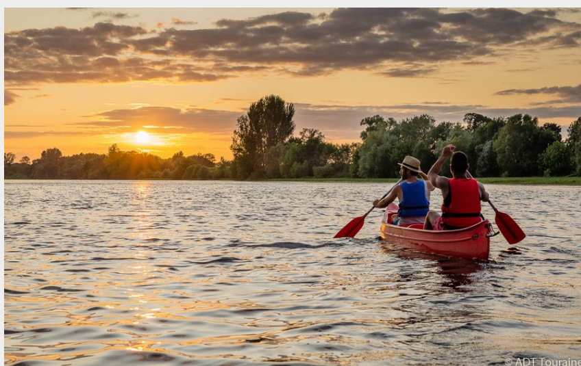
Coucher de soleil sur la Vienne