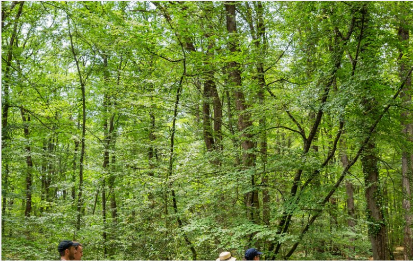
Personnes randonnant dans la forêt domaniale de Chinon