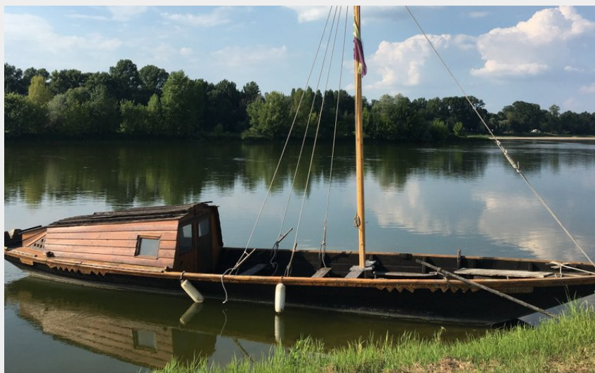
Photographie d'une toute sur la Loire