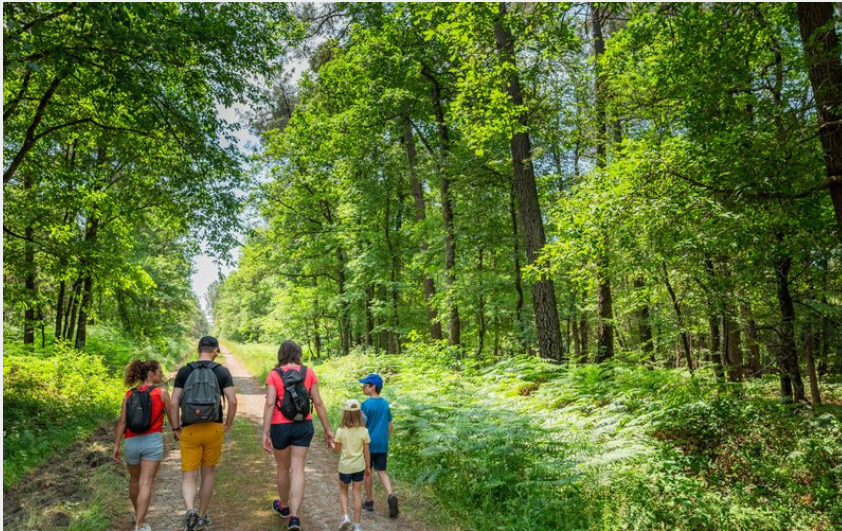
Photographie de personnes se promenant dans la forêt de Chinon