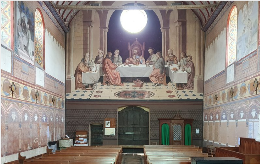
Vue de l'intérieur de l'église de Rivière