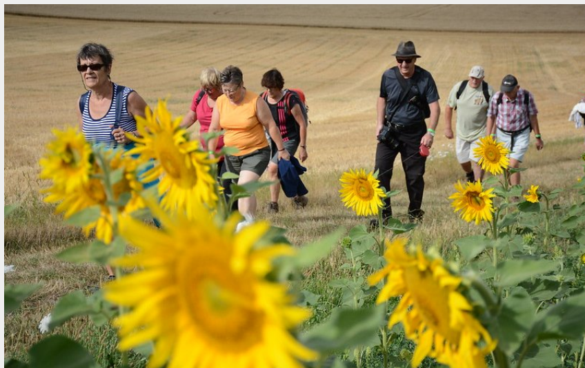
Photographie d'un champ de tournesol, avec randonneurs en fond (Aurore Poveda)