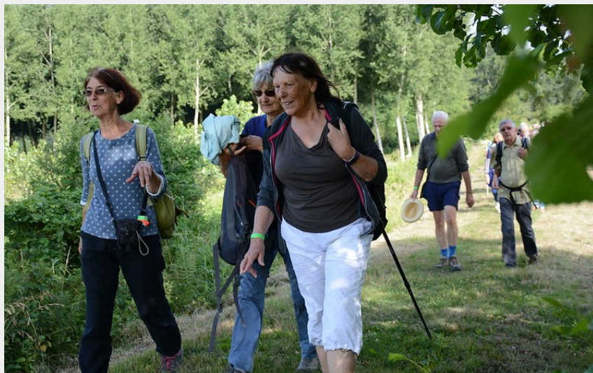
Photographie de randonneurs (Aurore Poveda)